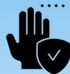
Palm Based Biometric