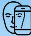
Face Based Biometric